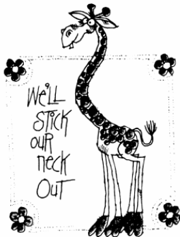
STRETCH YOUR TIME — ATTEND LAY RENEWAL