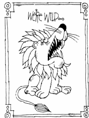
ABOUT LAY RENEWAL