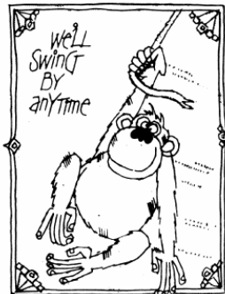
TO CATCH LAY RENEWAL