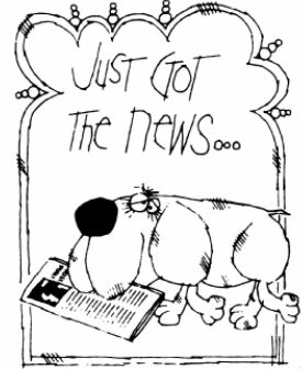
ABOUT LAY RENEWAL