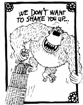
ATTEND LAY RENEWAL