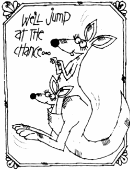
TO GO TO LAY RENEWAL

(PUBLICITY GROUP MAY HAVE BEST POSTER CONTEST WITH YOUTH & CHILDREN)