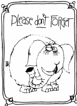
GOD LOVES YOU! COME TO LAY RENEWAL