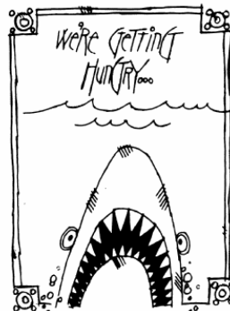
FOR LAY RENEWAL